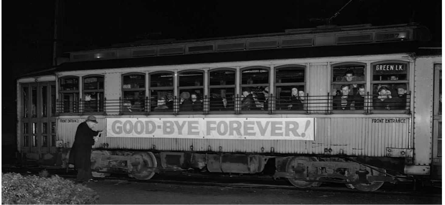
A passenger nails a sign reading "Goodbye Forever" on a streetcar for its last run on November 13, 1939, in Seattle, Washington.

defendants and others. The value of their products introduced in commerce and sold to the City Lines defendants and their operating companies for the year 1946 was over $11 million and, for the period from 1937 to May 1, 1947, over $37 million."